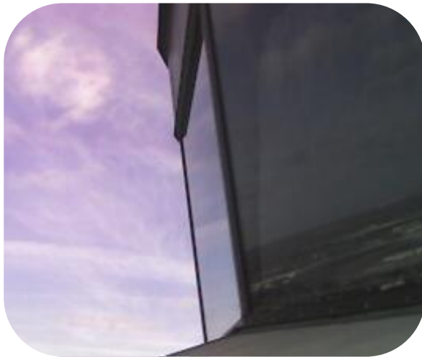
Exterior view showing glass tilted out at the top of an aircraft control tower.

Good glazing design will take account of the brightness of the items whose reflection is to be diminished. Street scenes or interior walls can generally have their reflection brought to a negligible level once they have been reduced by a factor of 4 by anti-reflection coatings. But a bright, point source of light such as the sun or an individual light bulb, is too bright to have its visible reflection effectively eliminated by a simple 4 times reduction. The solution for this situation is to position the glass and control its installed angle of tilt so that bright reflections are not seen by viewers in their typical occupancy locations. A very common example of this solution is in aircraft control tower glazing where the sloped glass reflects a barely visible image of an unlit matt black ceiling rather than the reflection of the bright outdoors, behind the observer, which would be seen with vertical glass.