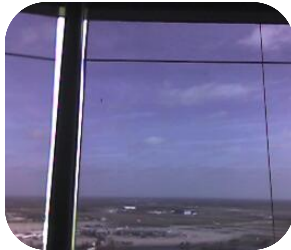
The view from the tower interior showing minimal distracting reflections.