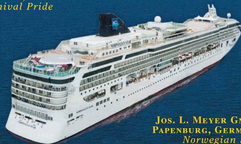
JOS. L. MEYER GMBH. PAPENBURG, GERMANY Norwegian Star