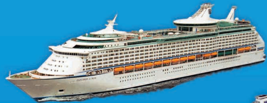
KVAERNER MASA-YARDS TURKU, FINLAND Explorer of the Seas