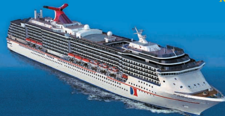
KVAERNER MASA-YARDS HELSINKI, FINLAND Carnival Pride